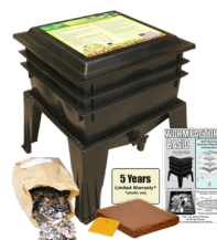
Worm Factory Basic Visit naturesfootprint.com with discount code: LANECOUNTY