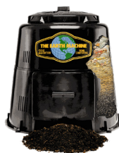
Earth Machine Available at BRING 4446 Franklin Blvd.

Compost workshops are on Saturdays from 10 a.m. - noon. For information on upcoming workshops, scan the QR code or enter the term "compost workshops" at extension.oregonstate.edu/search .